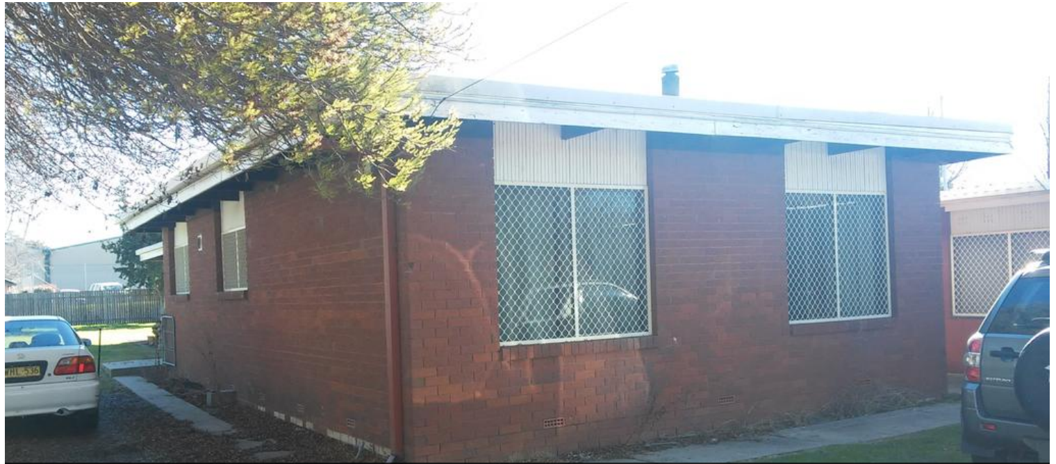
3, 68 Niagara St, Armidale