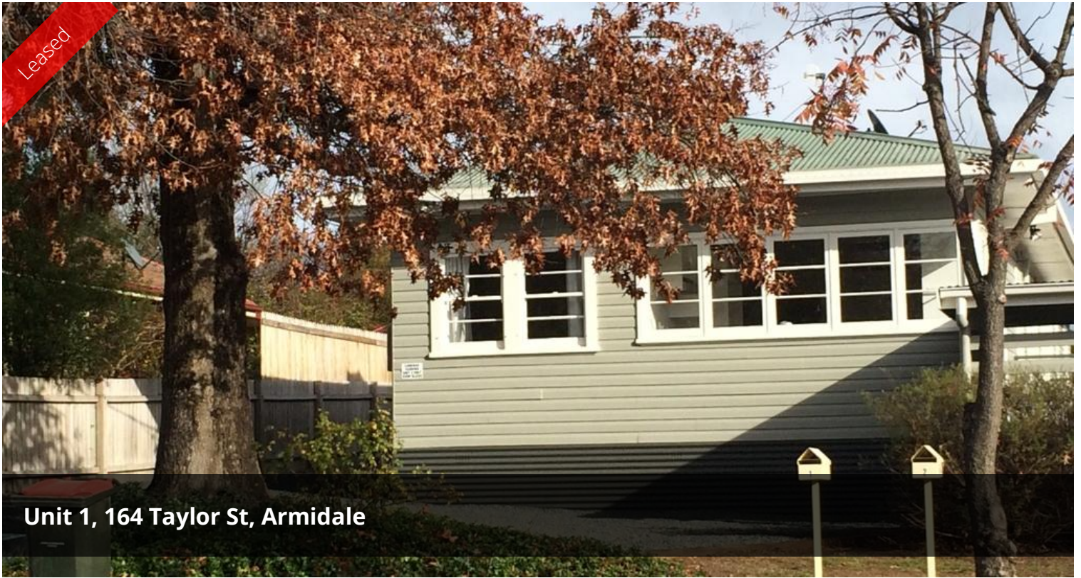
Unit 1, 164 Taylor St, Armidale