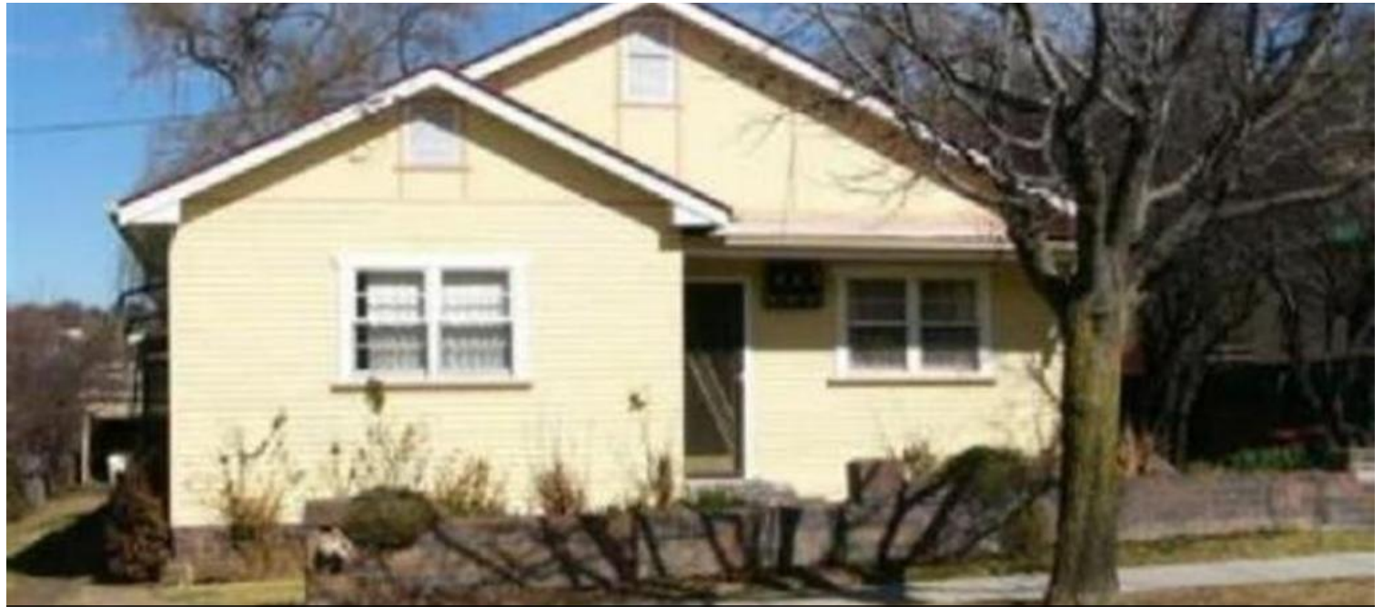
Unit 3, 92A Donnelly St, Armidale