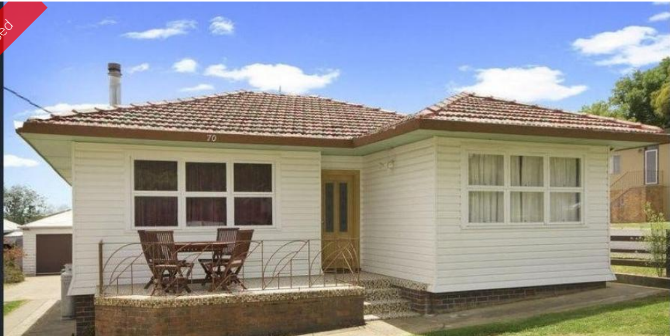
70 Markham Street, Armidale